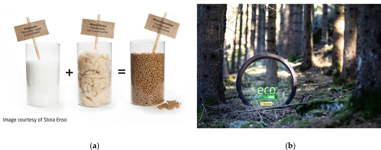
Figure 3. Printing material, i.e. granular bio-composite material, and commercial window product: (a) Granular material in bio-composites are used as raw material in the 3D printing process of NorDan. Bio-composite consist of wood fibres

During the innovation project, NorDan explored many options for printing materials, which included the likes of acrylonitrile butadiene styrene (ABS) and polypropylene (PP). If NorDan had decided to continue with those readily available materials in the market, the project would have been completed much earlier than it did. However, NorDan’s focus on sustainability directed the innovation project to focus on finding the most sustainable material possible so that the 3D printed windows would contribute to the SDGs (in particular Goal 9 and Goal 12) and remain in alignment with the other products in NorDan’s timber range. Because of this, the company decided to work with Stora Enso for material testing and development of a bio-composite granular material (Figure 3), aiming to achieve a high-wood content and excellent recycling properties. Stora Enso’s competence centre and factory for bio-composites is located in Smaaland, Sweden, in the same region as NorDan’s factory for entrance doors and BLB Industries. A unique innovation project cooperation between NorDan, BLB Industries and Stora Enso was established, and Goal 17 (Partnerships for the Goals) clearly evident throughout the project.